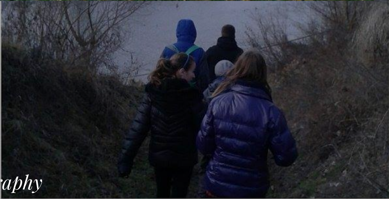
Time of outdoor geography