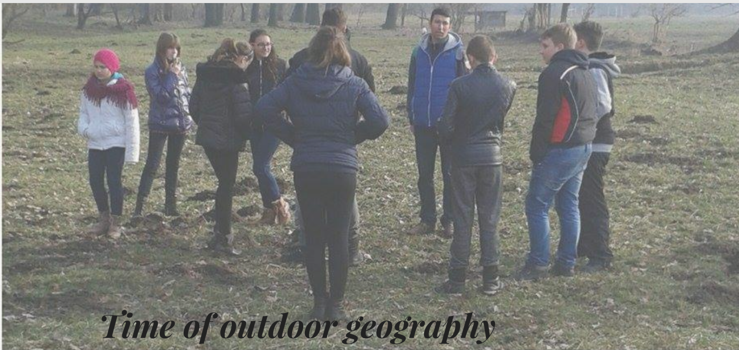
Time of outdoor geography